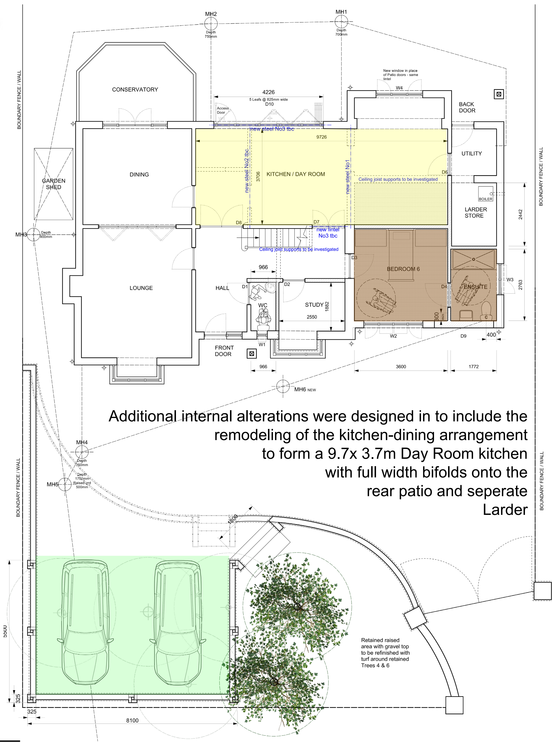
Additional internal alterations were designed in to include the remodeling of the kitchen-dining arrangement to form a 9.7x 3.7m Day Room kitchen with full width bifolds onto the rear patio and seperate Larder