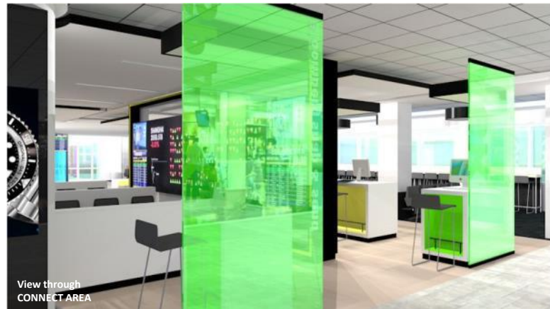
View through CONNECT AREA

The final result is a stylish lounge with work space and comfort levels to match all the passenger's needs during their stay at London City Airport.