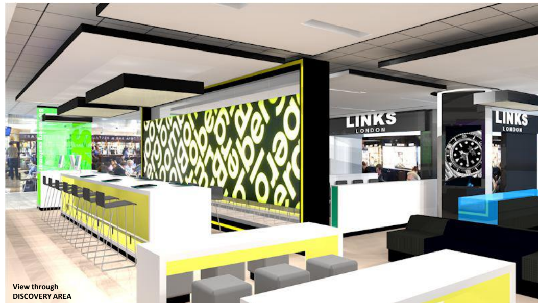
(Creative design-Imagination Europe Ltd. Project Management-Stace.Principle Contractor A.A.Lovegrove . Design development stDESIGN.)